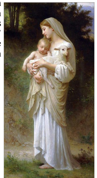
Innocence by William-Adolphe Bouguereau