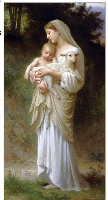
Innocence by William-Adolphe Bouguereau