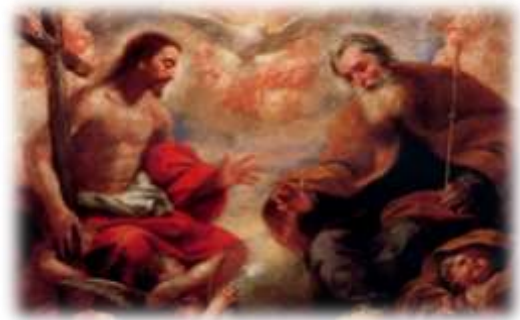
Cairo, F., 1607-1665, The Holy Trinity

If you love me, keep my commandments, says the Lord, and I will ask the Father and he will send you another Paraclete, to abide with you for ever, alleluia.