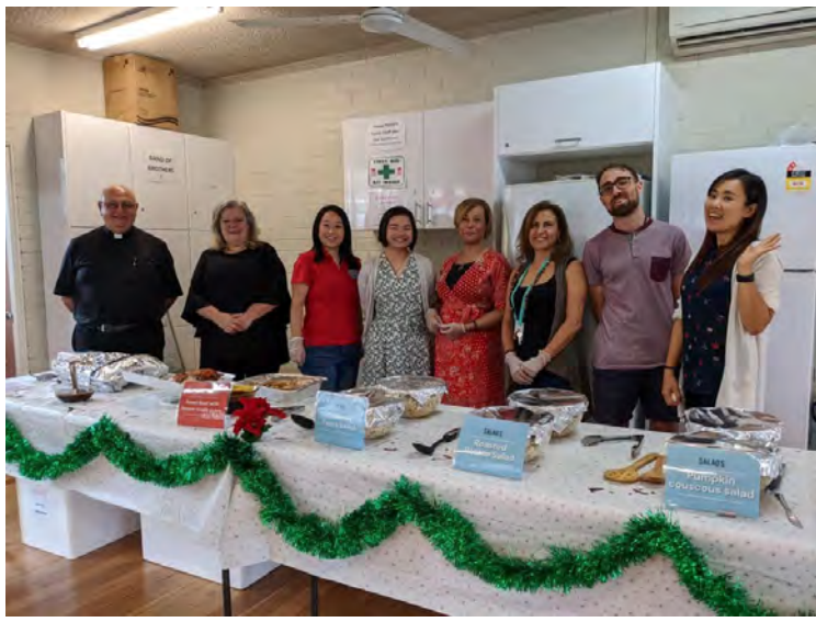
Volunteers Christmas Party 2020