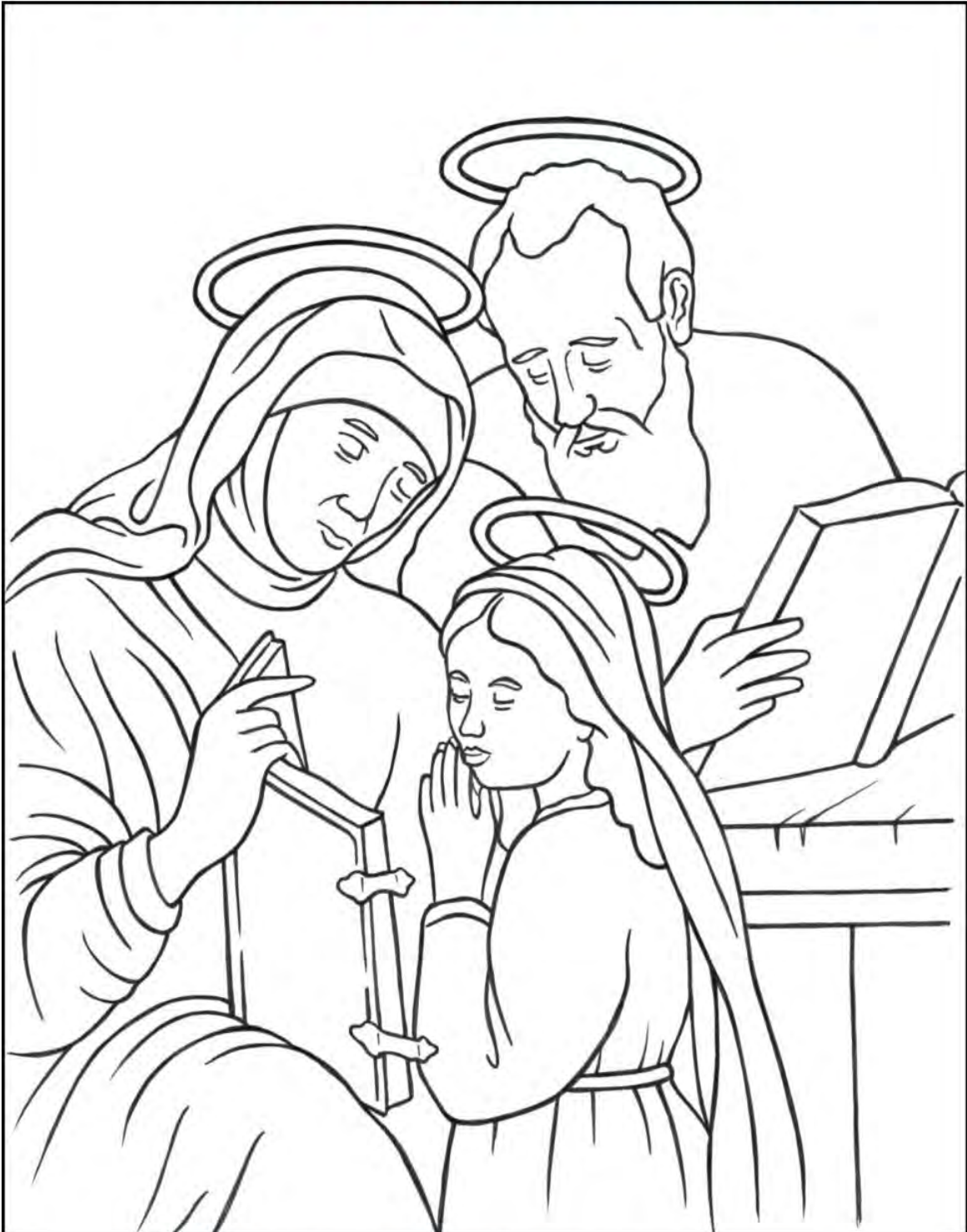
Saint Joachim, Saint Anne & Saint Mary

Must Submit by 23 rd JULY, Friday Email to events@olrfairfield.org.au