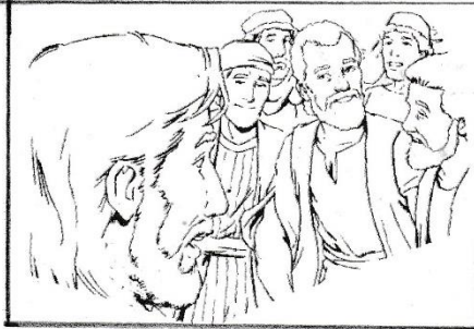
The next Sabbath He taught in the Jewish Meeting place.