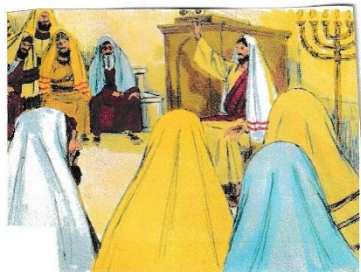
free Bible images

During a return visit to Nazareth, the next Sabbath He taught in the Jewish meeting place. Jesus found that He was not welcome anymore.