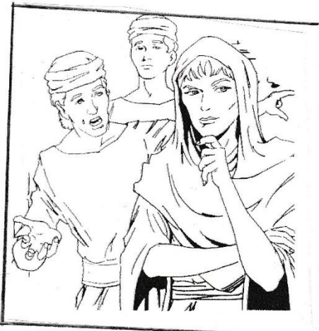
People were asking, 'How can He do all this?' 'Where did He get such wisdom and power to Work these miracles?'