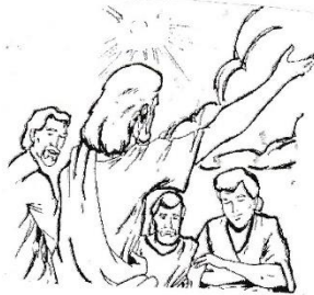
He was surprised that the people did not have any faith.