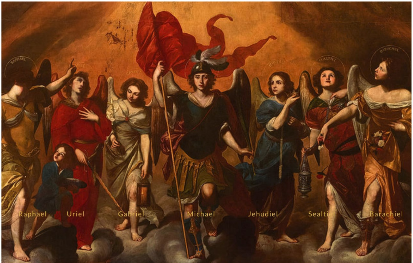
The Seven Archangels is a painting by Massimo Stanzione