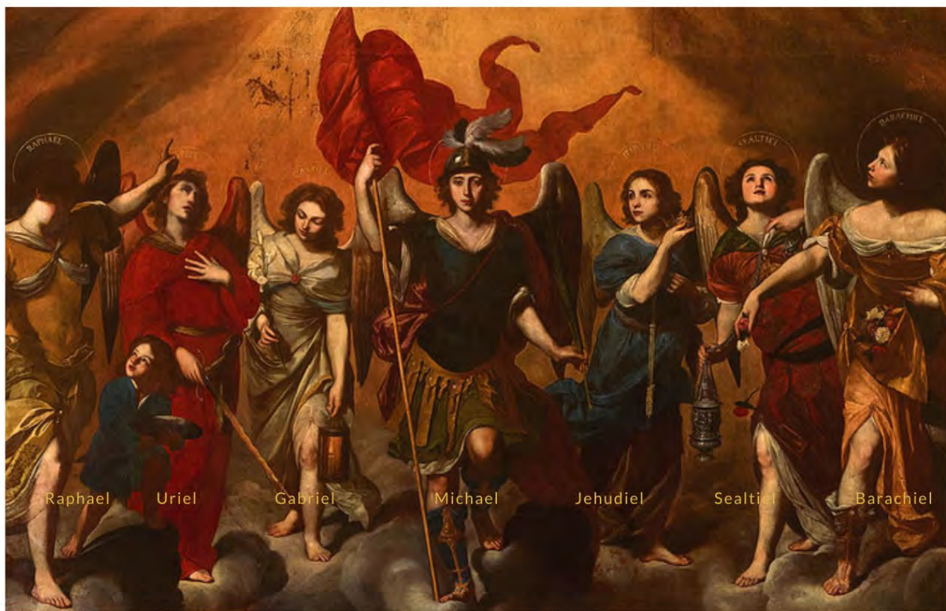
The Seven Archangels is a painting by Massimo Stanzione